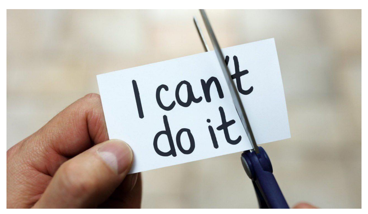
Change Can't to Can