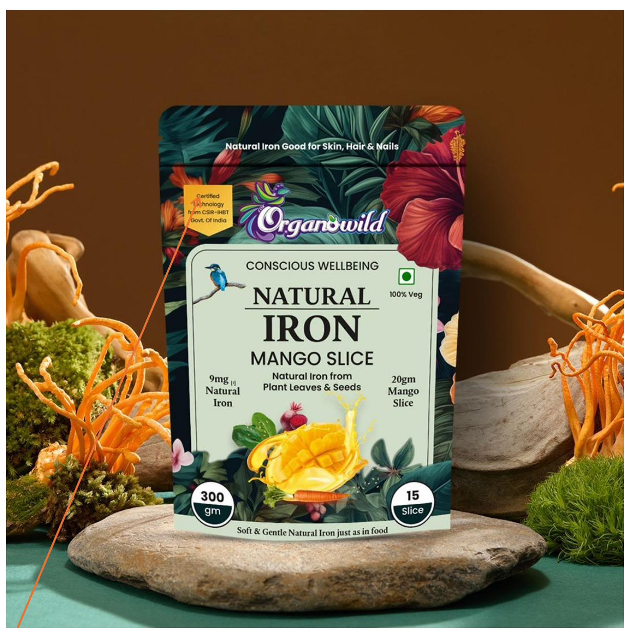
Organowild Natural Iron Mango Slice is Certified by: